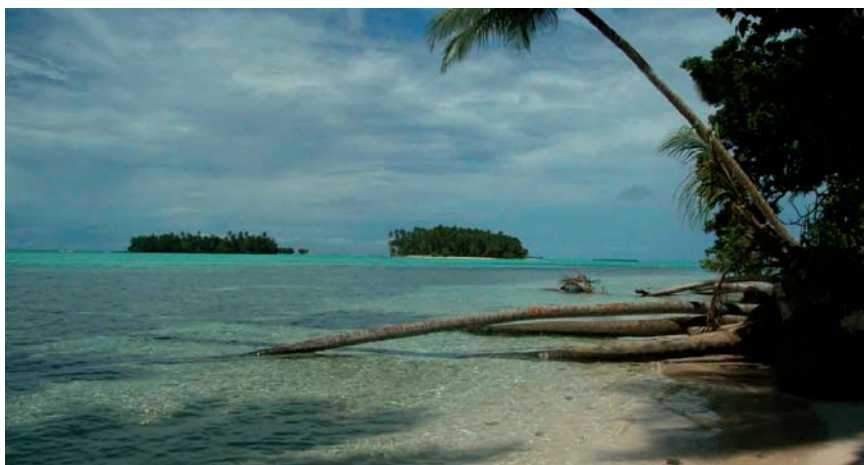
Huene a part of Carteret Islands. Huene used to be one island but has now been bisected by rising seas.