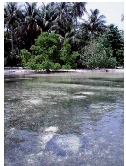
Flooded coconut tree: The stump in the water shows where the shoreline has retreated from.

The old people do not want to go, they rather drawn with the islands. This confuses the younger generations. They don't feel good to be separated from