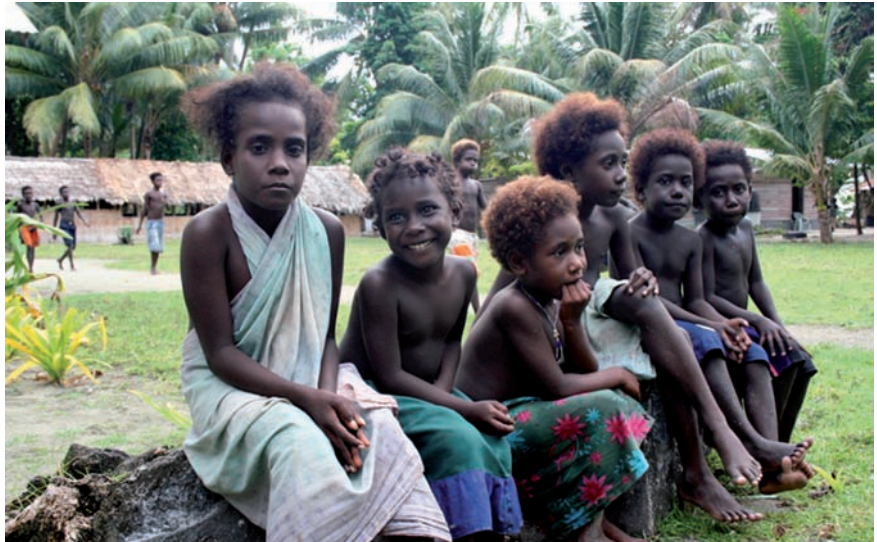
Kids with an uncertain future

Tulele Peisa ("Sailing the Waves On Our Own") is a locally registered NGO. The aims are firstly to create awareness amongst the Carteret Islanders and overseas. To influence and mobilize people,